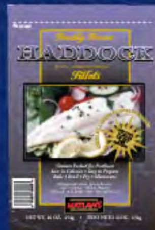
Haddock Fillets IQF UPC 0-52552-62800-3