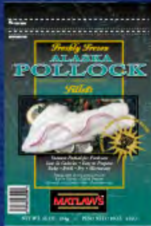
Pollock Fillets UPC 0-52552-62400-5