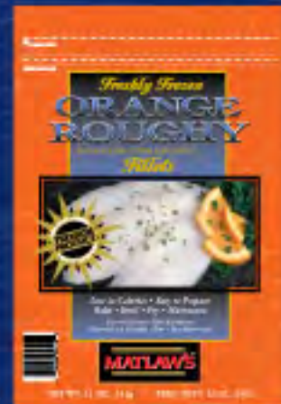
Orange Roughy Fillets UPC 0-52552-68312-5