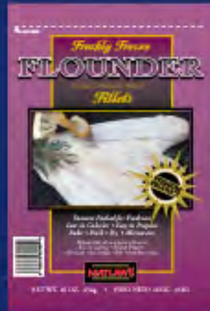
Flounder Fillets IQF UPC 0-52552-62900-1