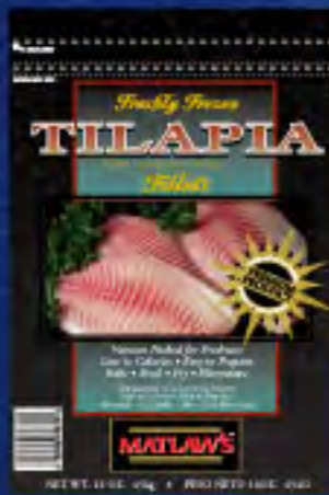
Tilapia Fillets UPC 0-52552-63213-0