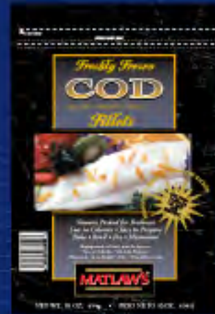
Cod Fillets UPC 0-52552-62500-2