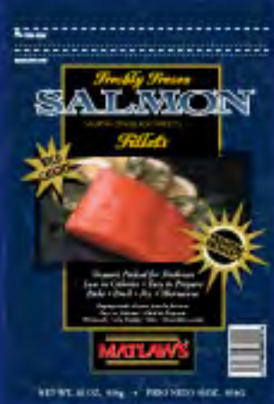
Salmon Fillets IQF UPC 0-52552-63209-3