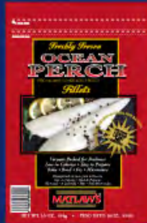
Ocean Perch Fillets UPC 0-52552-62200-1